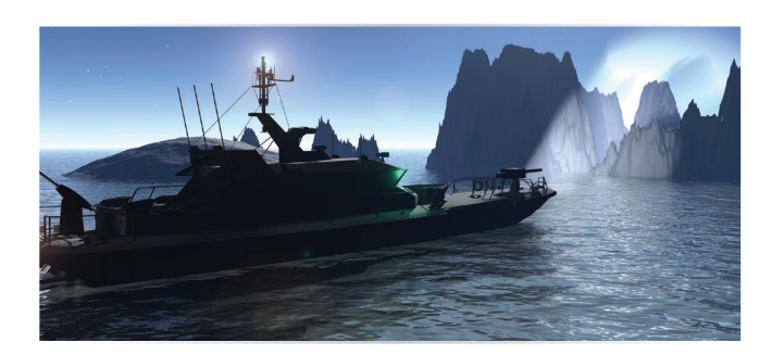
Search and rescue operations

Video and image capture is also available, making evidence collection simple and effective.