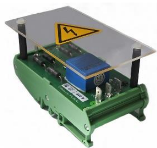
Figure 4: Voltage measurement