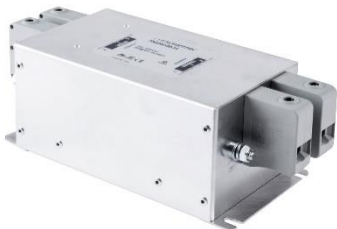
Figure 3: EMC filter