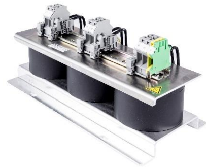
Figure 2: Choke Assembly