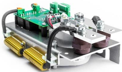
Figure 1: Pre-charge