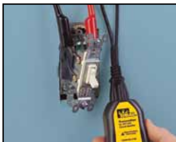
Alligator clip adapter allows connections to exposed wiring.