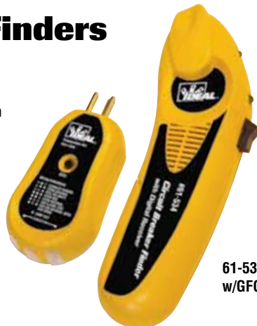
61-534 w/GFCI receptacle tester